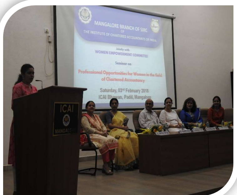
Seminar for Women CA's and Students as on 03.02.2018 at ICAI Bhawan, Padil, Mangaluru